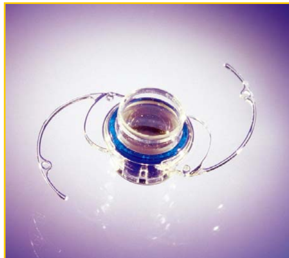
FIGURE 2: IMPLANTABLE MINIATURE TELESCOPE (BY DR. ISAAC LIPSHITZ)

The intraocular telescope is intended to improve distance and near vision in people who have lost central vision in both eyes because of end-stage AMD . The intraocular telescope is about the size of a pea and is surgically placed inside one eye. The implanted eye provides central vision. The other eye provides peripheral vision . A picture of the intraocular telescope is shown in Figure 2.